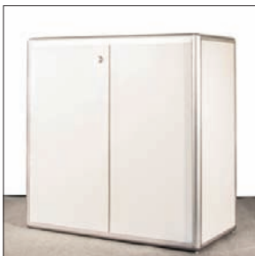
Locker EUR 38.00 Code 024.000.140.040 (100 x 50 x 96 cm)