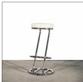
White bar stool EUR 11.00 Code 025.010.040.079