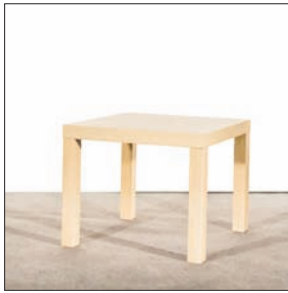
Coffee table 55/55 EUR 21.00 birch effect Code 025.010.030.055 (55 x 55 x 45 cm)