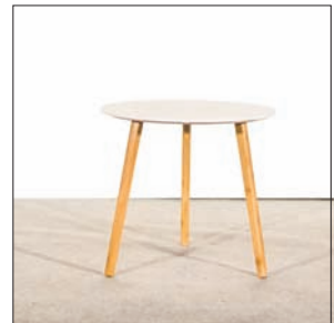
Winter coffee table EUR 12.00 Code 025.010.020.192 (50 cm diameter; H: 45 cm)