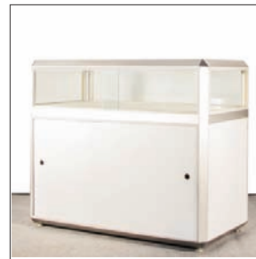
SMADO showcase desk EUR 45.00 Code 025.010.160.040 (100 x 50 x 70 cm)