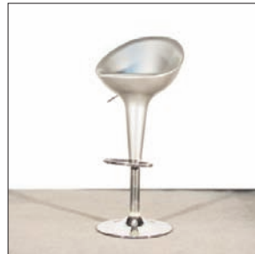
ABS bar stool EUR 12.00 Code 025.010.040.082 – grey Code 025.010.040.083 – red Code 025.010.040.085 – orange