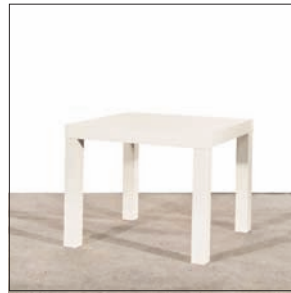
Coffee table 55/55 EUR 21.00 Code 025.010.030.050 (55 x 55 x 45 cm)