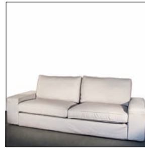
3 seats sofa with cover EUR 100.00 Code 025.010.010.080 (230 x 90 x 70 cm)