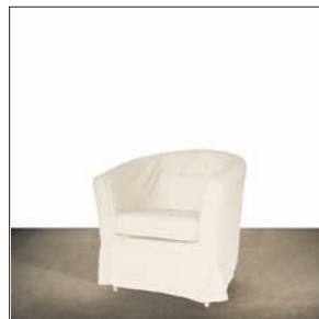
Armchair with cover EUR 26.00 Code 025.010.010.020 (80 x 70 x 80 cm)