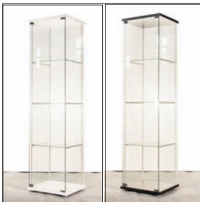
Showcase glass door EUR 60.00 Code 025.010.200.035-white Code 025.010.200.036-black (40 x 35 x 164 cm)