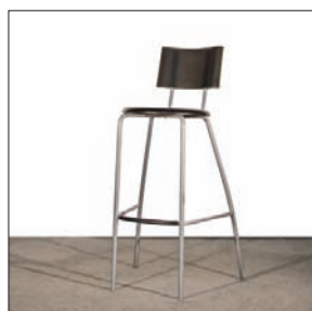
ANSSI bar stool EUR 12.00 (with back) Code 025.010.040.084