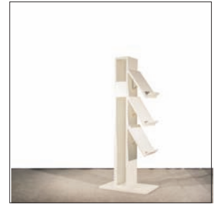
PAL leaflets support EUR 44.00 Code 025.010.150.040