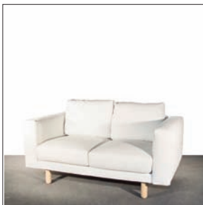
2 seats sofa with cover EUR 72.00 Code 025.010.010.070 (160 x 90 x 70 cm)