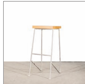
Domicilio stool EUR 26.00 wooden seat Code 025.010.040.140 (36 x 34.5 x 75 cm)