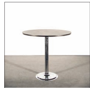
Total Mob table EUR 21.00 Code 025.010.030.045 (80 cm diameter; H: 73 cm)