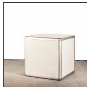
Display cube EUR 18.00 Code 024.000.140.010 (50 x 50 x 50 cm)