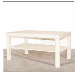
Coffee table 90/55 white EUR 9.00 Code 025.010.020.196 (90 x 55 x 45 cm)