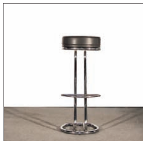
Black bar stool EUR 11.00 Code 025.010.040.080