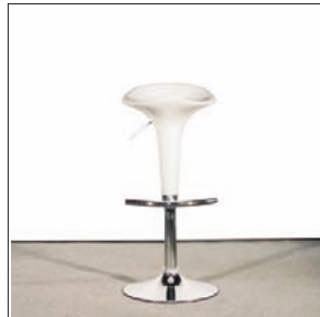
Vida ABS bar stool-white EUR 12.00 Code 025.010.040.170 (38 x 36 x 66-87 cm)