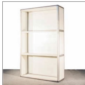
Shelves rack EUR 38.00 Code 024.000.140.070 (94 x 29 x 150 cm)