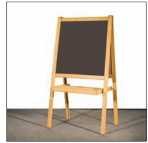
Wooden easel EUR 14.00 Code 025.010.120.168