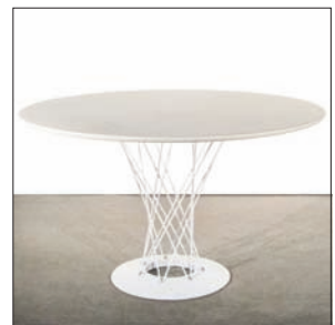
Domicilio table EUR 90.00 Code 025.010.020.150 (120 cm diameter; H: 70 cm)