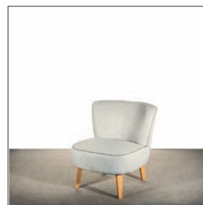
Jim armchair - gray EUR 45.00 Code 025.010.010.060 (60 x 60 x 75 cm)