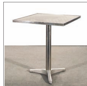
Aluminium table EUR 21.00 (square) Code 025.010.020.000 (60x60x68 cm)