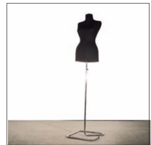
Tailoring bust EUR 26.00 Code 025.010.400.010