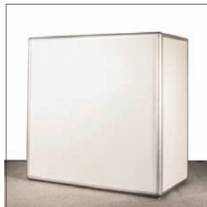
Information desk EUR 38.00 Code 024.000.140.080 (90 x 50 x 100 cm)