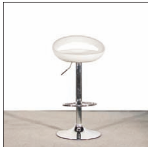
Miami ABS bar stool-white EUR 12.00 Code 025.010.040.160 (47 x 40 x 60-80 cm)