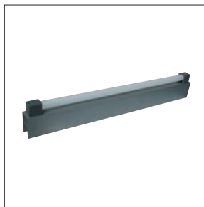
Corp fluorescent tip SS30 cu un tub D-170 Cod 019.010.190.000