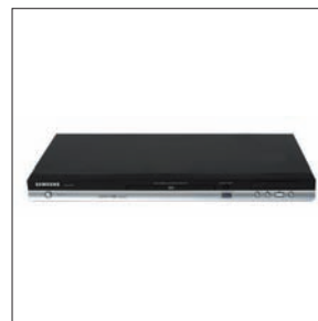
DVD Player Cod 025 010 130 030