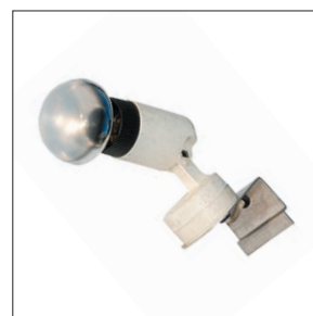
Lampa spot SS30 100W EUR 12.00 Cod 019.010.200.008