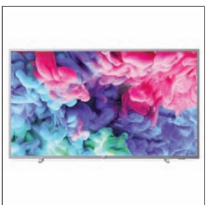
TV LED SMART 4K, UHD ultrasubtire (diagonala ecran: 126 cm) Cod 025 010 130 045