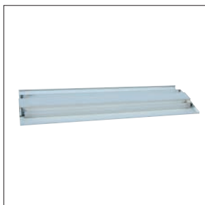
Corp fluorescent tip OCTANORM cu doua tuburi D-171 Cod 019.010.200.000