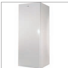
Frigider ARCTIC 255 l Cod 025 010 020 199