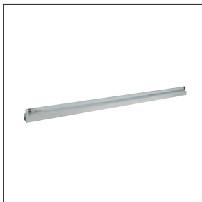
Lampa fluorescenta FIA cu instalatie electrica completa 1x40W Cod 019.010.110.000