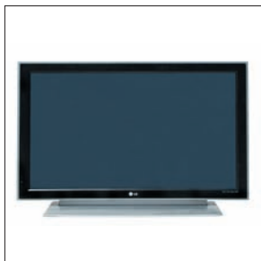
TV Plasma (diagonala ecran: 107 cm) Cod 025 010 130 040