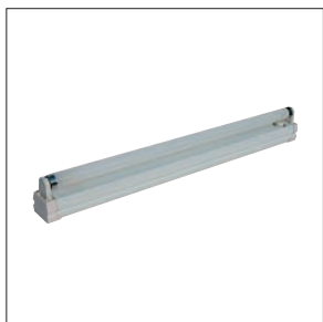
Corp fluorescent tip SS30 cu un tub D-170 - A Cod 019.010.190.001