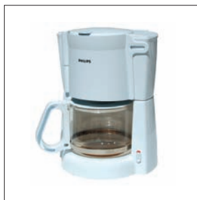
Filtru de cafea Cod 025.010.120.010