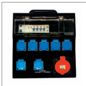
Panou Electric 380V/220V Cod 019.010.265.000