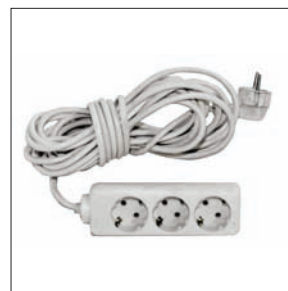
Prelungitor 230V, 10A, 5m Cod 019.010.279.000