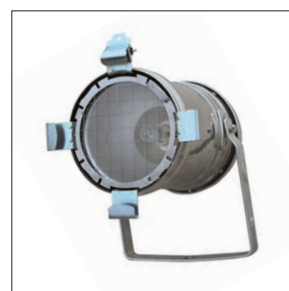
Reflector HIGHLITE HQI 150W EUR 35.00 Cod 019.010.390.000