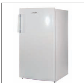
Frigider ARCTIC FB 155 Cod 025 010 020 198