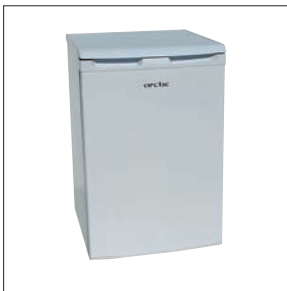
Racitor (140 l) Cod 025 010 070 010 (55 x 61 x 84 cm)