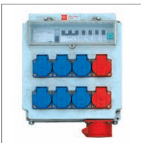
Panou Electric OCTANORM Cod 019.010.275.000