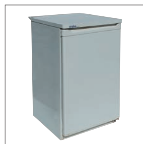
Frigider ARCTIC (180 l) Cod 025 010 070 020