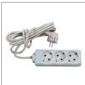
Prelungitor 230V, 10A, 3m Cod 019.010.277.000