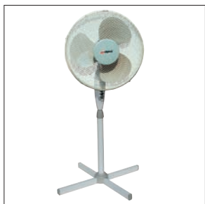
Ventilator cu picior Cod 025.010.500.020