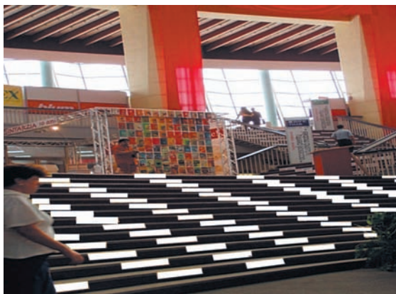
STICKERS DISPLAY ON PAVILION'S STAIRS AND FLOOR