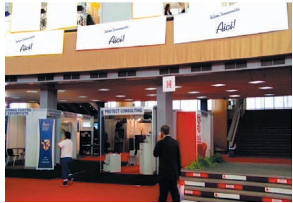
BANNER DISPLAY ON PAVILION A, FRIEZE 4.50