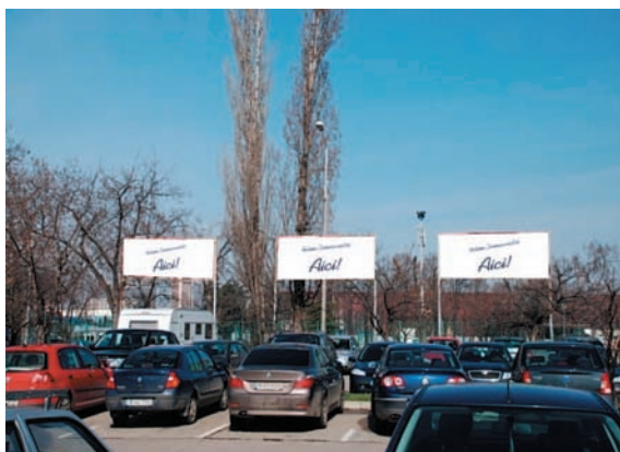
BANNER DISPLAY AT PARKING-GATE B