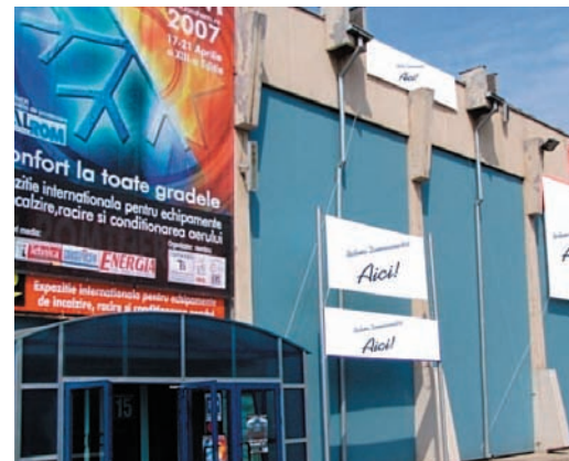
BANNER DISPLAY ON PAVILION C1 FACADE