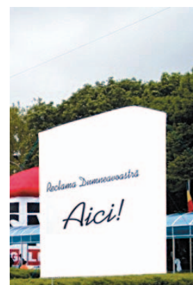
ADVERTISING MASCOTS DISPLAY