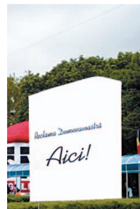
ADVERTISING MASCOTS DISPLAY