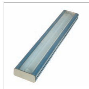
Corp fluorescent tip SYMA STAR Cod 019.010.200.001