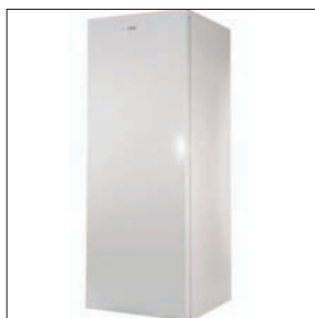
Frigider ARCTIC 255 l Cod 025 010 020 199