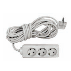
Prelungitor 230V, 10A, 5m Cod 019.010.279.000