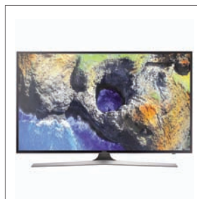
TV SAMSUNG UHD, (diagonala ecran: 163 cm) Cod 025 010 130 047