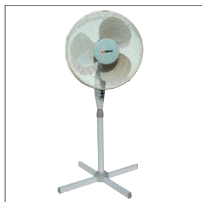
Ventilator cu picior Cod 025.010.500.020