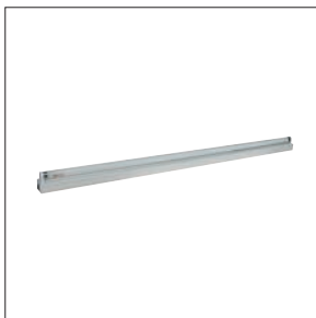
Lampa fluorescenta FIA cu instalatie electrica completa 1x40W Cod 019.010.110.000