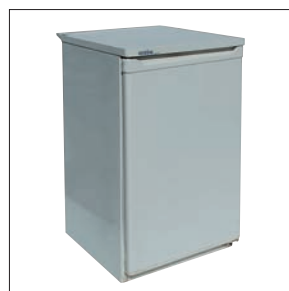
Frigider ARCTIC (180 l) Cod 025 010 070 020