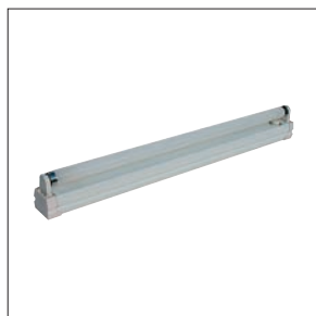
Corp fluorescent tip SS30 cu un tub D-170 - A Cod 019.010.190.001