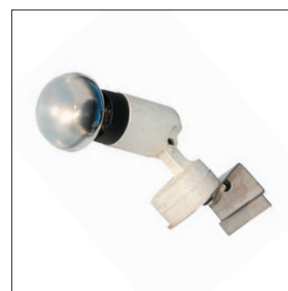
Lampa spot SS30 100W EUR 12.00 Cod 019.010.200.008