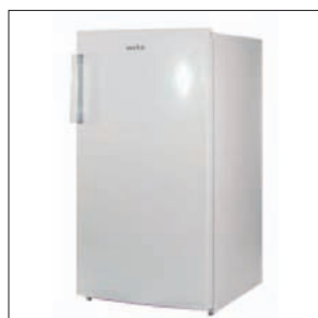
Frigider ARCTIC FB 155 Cod 025 010 020 198