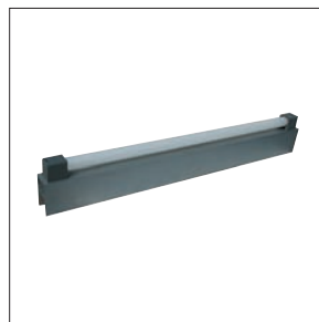
Corp fluorescent tip SS30 cu un tub D-170 Cod 019.010.190.000