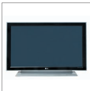
TV Plasma (diagonala ecran: 107 cm) Cod 025 010 130 040