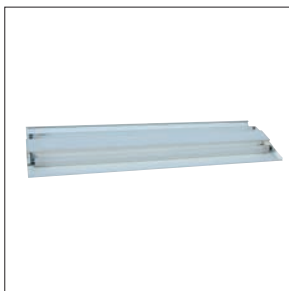
Corp fluorescent tip OCTANORM cu doua tuburi D-171 Cod 019.010.200.000