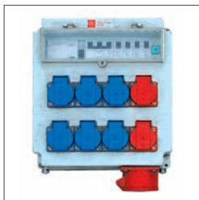
Panou Electric OCTANORM Cod 019.010.275.000