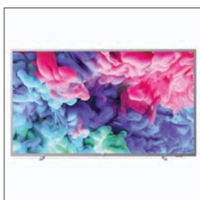
TV LED SMART 4K, UHD ultrasubtire (diagonala ecran: 126 cm) Cod 025 010 130 045