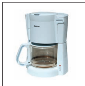
Filtru de cafea Cod 025.010.120.010