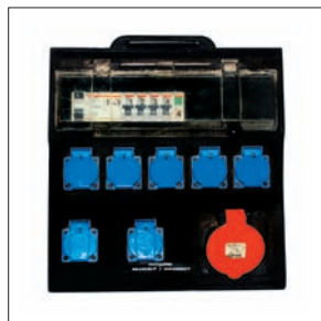
Panou Electric 380V/220V Cod 019.010.265.000