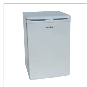
Racitor (140 l) Cod 025 010 070 010 (55 x 61 x 84 cm)