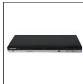
DVD Player Cod 025 010 130 030