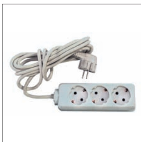
Prelungitor 230V, 10A, 3m Cod 019.010.277.000